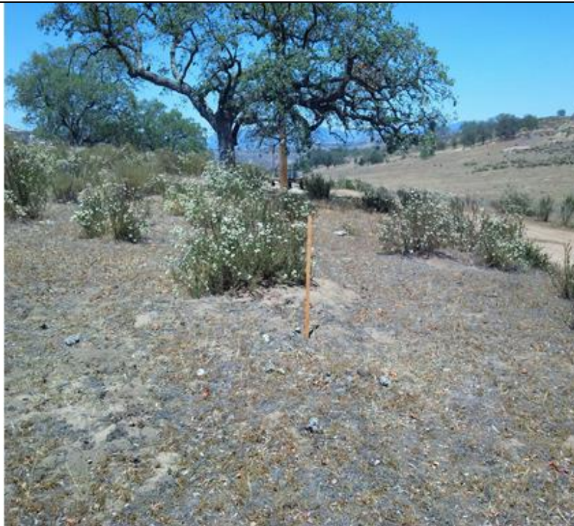
Photograph 3: Proposed block anchor location (wooden stake) to be surrounded by an approximately 36 square foot temporary workspace area (not shown) near Structure No. P102 (in background), facing east.