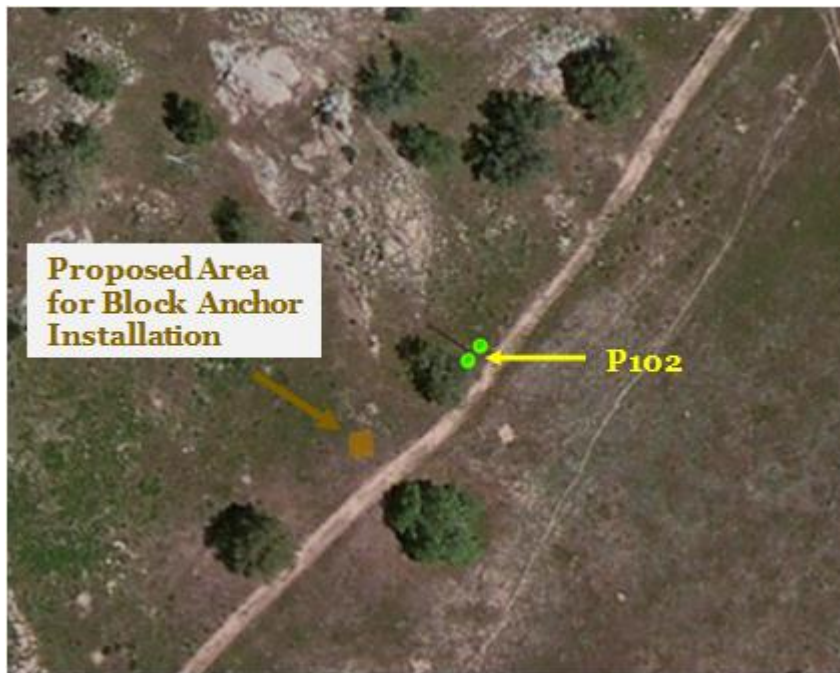
Figure 2b: Aerial image of proposed temporary workspace area for the installation of a block anchor near Structure No. P102.