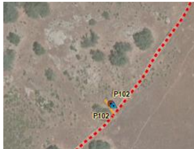
Figure 1: Overview Map showing the Project area (as included within the PEA and PTC) near Structure No. P105 in the vicinity of the proposed locations for SS-15A and SS-15B, left figure, and area near Structure No. P102, where the proposed block anchor would be installed, right figure. The existing approved project access road is shown as a dashed red line, and footpath access as a yellow and black line.