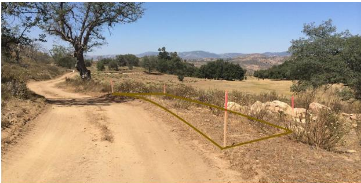
Photograph 2: Proposed SS-15B temporary workspace area (outlined in brown) facing east.