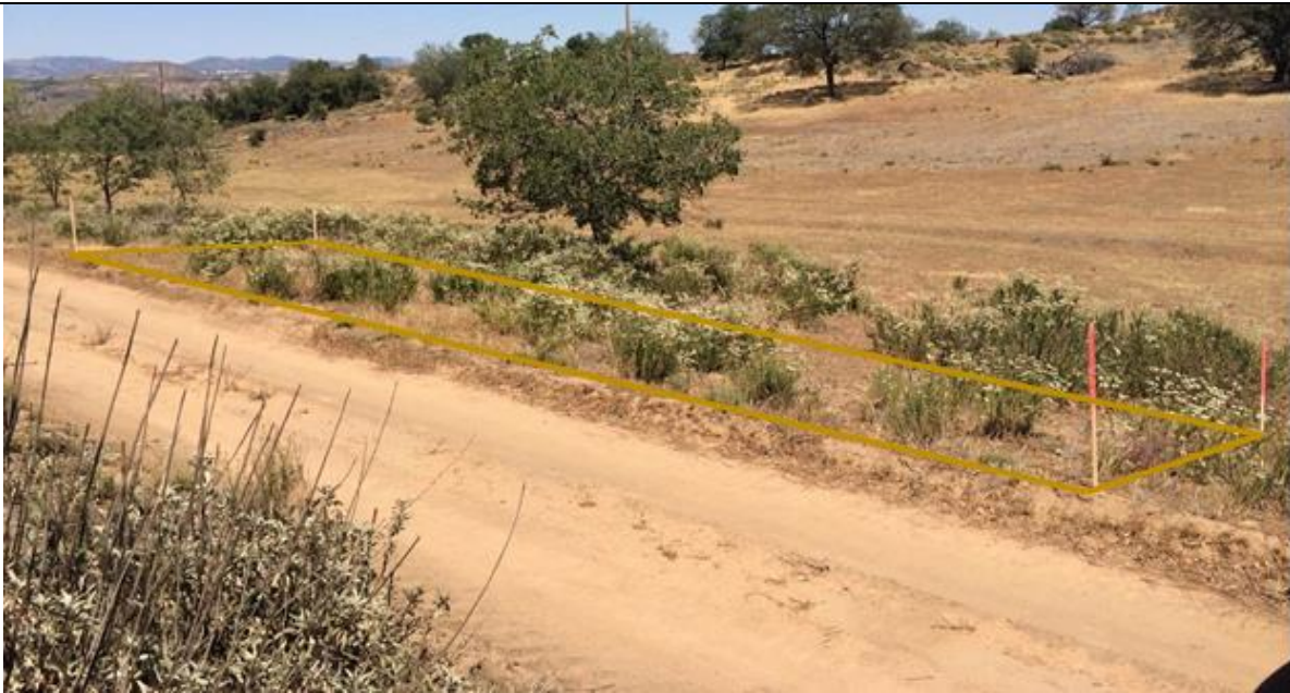
Photograph 1: Proposed SS-15A temporary workspace area (outlined in brown), facing southeast.